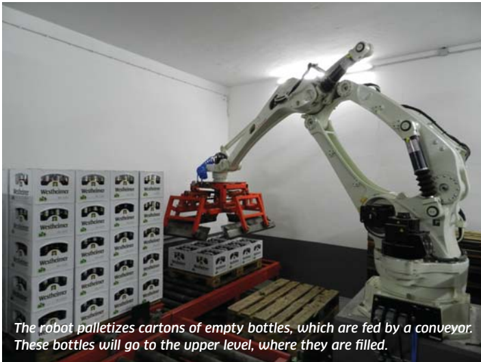
The robot palletizes cartons of empty bottles, which are fed by a conveyor. These bottles will go to the upper level, where they are filled.