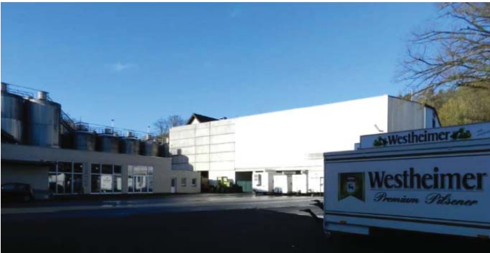
Westheimer Brewery is automating their processes after 150 years of business.

Westheimer Brewery, founded in 1862, is a private brewery rooted in more than 150 years of tradition. From their factory in the Sauerland region of Germany, they produce regional beer specialties and prepare them for distribution both regionally and internationally. In order to remain competitive in an increasingly diversified market, Westheimer installed a Kawasaki robot in August 2017, one of the first to do so among their competitors. The ease, flexibility and efficiency of their automated system has inspired them to automate additional processes in the future.